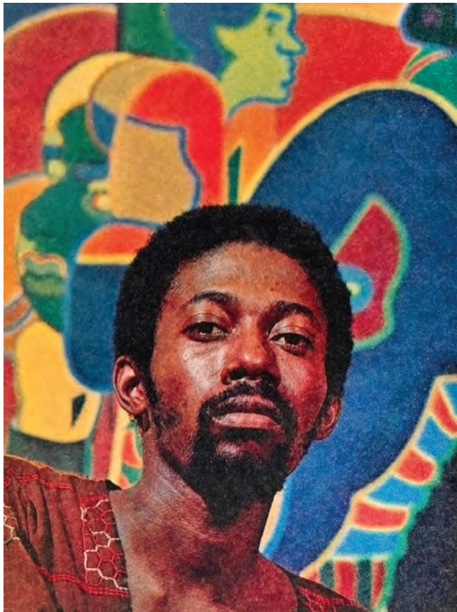
Ellsworth Ausby, Collection of the Smithsonian National Museum of African American History and Culture, © Tuesday Publications, Inc., 1970 | photo © Doug Harris

Born in Portsmouth, Virginia, Ausby moved to New York City to attend the School of Visual Arts and the Pratt Institute. The work in the exhibition will span the decade between 1969-79, showing Ausby's artistic development from totemic paintings with a metaphorical Africanist symbolism, to the more minimalist, multi-part unstretched canvases.