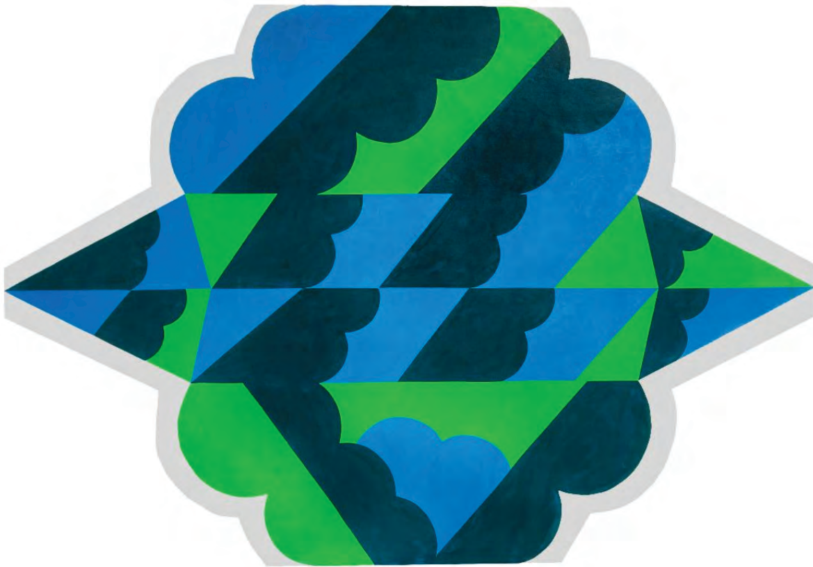
Ellsworth Ausby | Untitled | 1971-72 | acrylic on canvas | 72h x 104w in

The exhibition will be accompanied by a series of public programs and a fully illustrated catalogue.