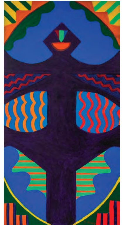
Ellsworth Ausby | Untitled | 1969 acrylic on canvas | 89 1/2h x 41 1/2w in

Ausby was employed in the late 1970s by the Cultural Council Foundation as an artist under the CETA program to bring arts programming and projects to underserved communities. From 1978-79 Ausby received CETA artist grants that allowed him to create major public works. One of these was InnerSpace/OuterSpace , a multimedia performance piece conceived and directed by Ausby that included dance, poetry, music, and drama, accompanied by lights and slides of Ausby’s paintings and sculpture. It was performed at the Museum of Natural History, New York.