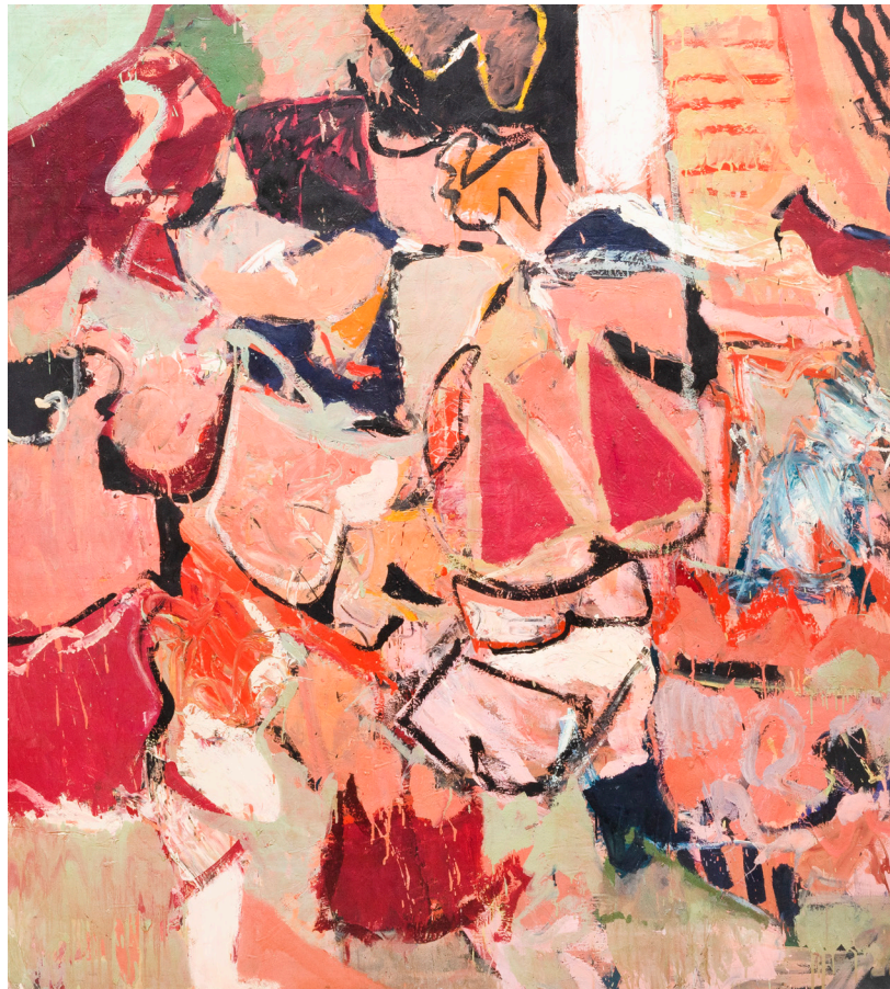
Susan Fortgang | Interior with Red & Green | 1966 oil on canvas 71 1/8 x 64 1/8 in.

The exhibition will be accompanied by a fully illustrated catalogue featuring an essay by Stephen Westfall.